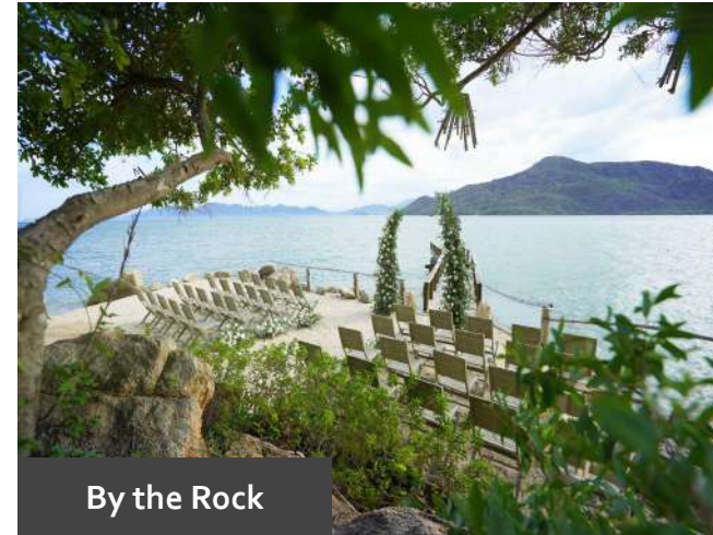
By the Rock