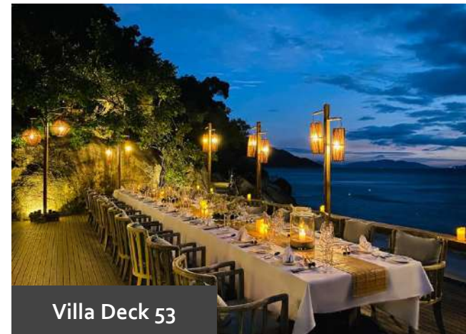
Villa Deck 53